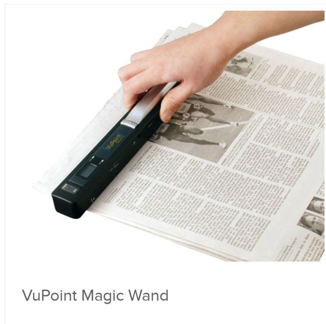
VuPoint Magic Wand